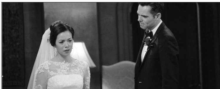
Sabrina (Teresa Castillo) is pregnant with Patrick's (Jason Thompson) baby.

First and foremost, Patrick (Jason Thompson) made his choice. Patrick was placed in a sticky situation having to choose from his back from the dead wife, Robin (Kimberly McCullough) or his almost bride, Sabrina (Teresa Castillo). Inquiring minds knew that Patrick would choose Robin; I mean come on they're destined to be together. Unfortunately, it leaves Sabrina with a broken heart, but I fear that may not be the end of things for the jilted bride. Just when Patrick came up with the unique idea of asking Robin to have another child with him, Sabrina is preggers with Patrick's baby! This does not bode good news for the newly reunited couple and could cause Patrick to have another mental breakdown. Speaking of Sabrina, she has been getting cozy with her ex Carlos, who