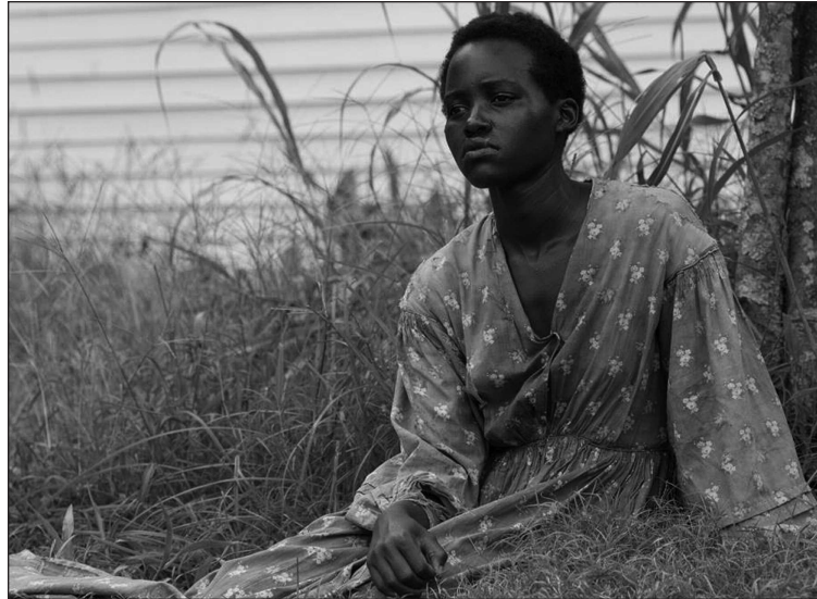
Lupita Nyong'o is sure to be nominated in the Best Supporting Actress race.

men propel to the forefront, Jared Leto in "Dallas Buyers Club" and Michael Fassbender for "12 Years a Slave." The race is ultimately between these two gentlemen in my opinion. Another likely candidate who will hear Oscar calling is newcomer Barkhad Abdi who is superb as one of the Somali pirates in "Captain Phillips." This now leaves the last two seats open, some are predicting a nomination for Tom Hanks for "Saving Mr. Banks," while that seems likely, I honestly don't see that happening, Hanks is more likely to land a nomination for Best Actor for "Captain Phillips." Rarely are actors nominated twice, unless they deliver unbelievable work in different films.