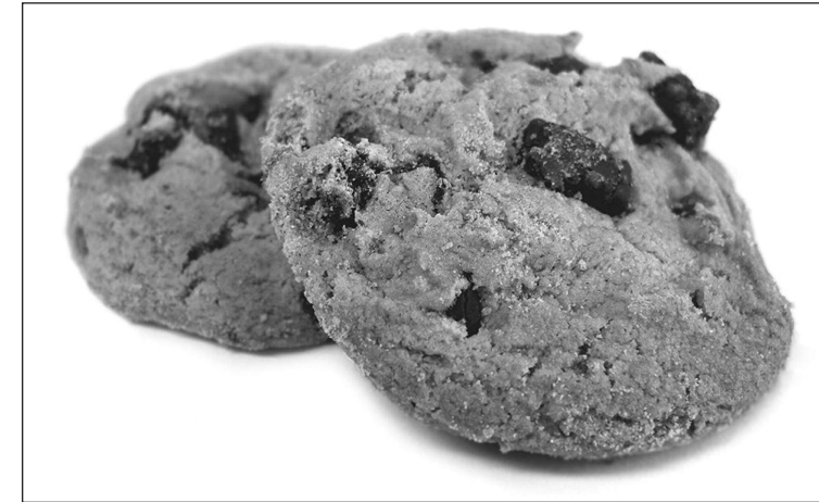
Fitness tip: keep these out of sight.

UNITED STATES—Let's go to something very simple and helpful to hang onto: the non-negotiable concept of out of sight. If there are foods for which we have no preference in the 30 pounds in 30 days plan, better off to keep them out of sight. Out of sight, out of mind. And this diet is a diet for both the mind and the body.