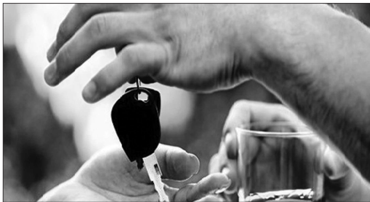
AAA's Free Tippy Tow is only available on New Year's Eve and July 4.

According to their website, arrests involving Drinking Under the Influence (DUI) have risen dramatically since last year. The free service will take the inebriated party to their desired location as long as it is within a seven-mile radius of where they were picked up. It is available to both members and non-members of AAA. To utilize