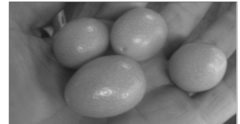
The kumquat is a cross between an orange and an apricot.

In various parts of the world, the fruit is used as an addition to many drinks like teas and liquor for added flavor. Kumquats deliver a hefty dose of Vitamin A and C, but it also is a vital source of calcium, magnesium and potassium for consumption. Kumquats may not be as popular in many American homes, but give this unique fruit a try; you may be surprised