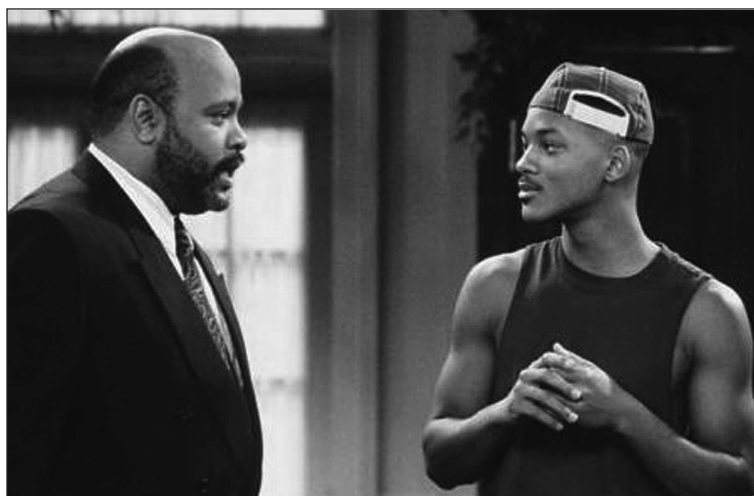
James Avery with fellow co-star Will Smith in an episode of "The Fresh Prince of Bel Air."