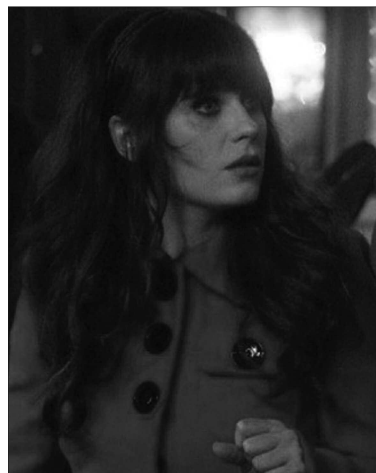
Jess, played by Zoe Deschanel boasts a bright pink pea coat by Kate Spade in the Christmas episode.

A similar fit in episode 11 features a bold jade green colored shift matched with a teal cardigan. These two colors surprisingly fit well together, yet still give her a formal look, as she was in court with Nick's girlfriend over a ticket, in which she pleaded guilty out of nervousness. Why do we all love this character so much? There is something very real about her that most people can relate