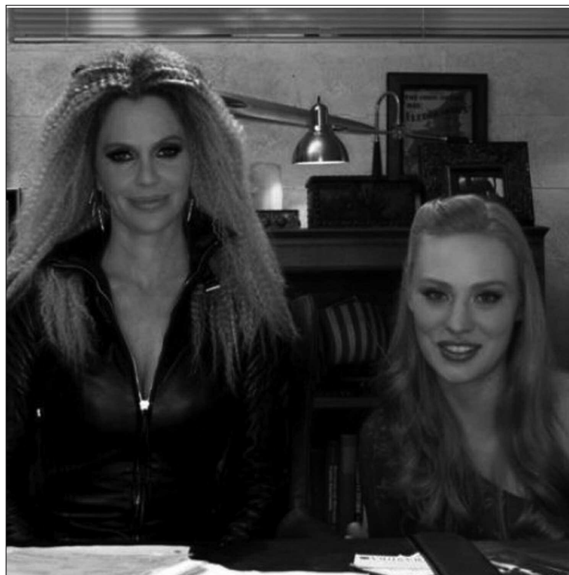
Pam (Kristen Bauer van Straten) and Jessica (Deborah Ann Woll) from "True Blood."

Sookie and her faerie friends attempted to make contact with her deceased parents where she realized that Claudine attacked the vampire who killed her parents. It was later revealed