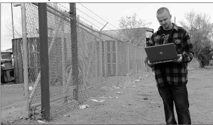
Jesse (Aaron Paul) is on a downward spiral.

Walter is indeed a cunning character, using his cancer diagnosis to make his son feel sympathetic for his condition and thwarted Marie's plan. Marie blew a casket when she learned her husband has not yet divulged details about the case to his colleagues. That woman just sees no logic in anything. Walter's spirits may be high, but he is indeed