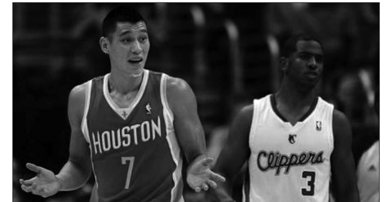
Houston's Jeremy Lin's grouse at officials led to a 137-118 loss to the Clippers. half to lead the team with 26 points and three rebounds. The Clippers take the road on a three game trip through the south-east to face the Orlando Magic.

Paul ended the Clippers fourth game going 7-13, with 23 points and 17 assists that gave him his 51st career game among active players to go 15-15 on points and assist trailing Lakers forward Steve Nash. Redick added six more in the second