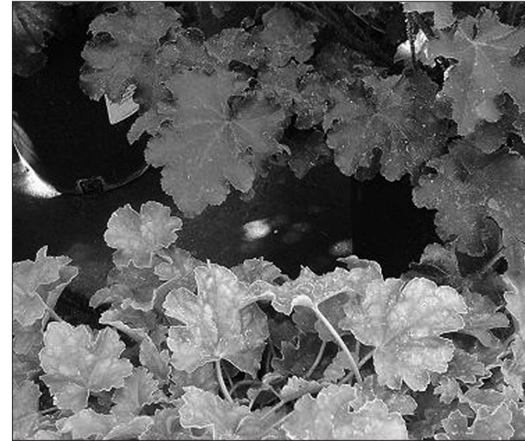
Chartreuse coral bells contrasts with bronze.

The so called 'evergreen' daylilies can be even messier. New foliage is rather delicate, so it is easily tattered by the removal of old foliage. The 'deciduous' types may seem to be less appealing because they are bare for part of autumn and winter, but are so much easier to groom by simply removing