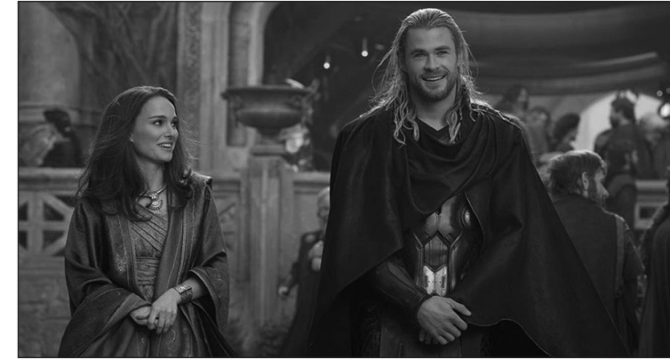
Natalie Portman and Chris Hemsworth in "Thor: The Dark World."

This time around the special item that has both good and evil fighting is known as the Aether. This unknown entity finds its way to Thor's love interest Jane (Natalie Portman) who holds the key to saving Earth and multiple realms. So in essence this brings the two love birds back together, as they haven't seen one an-