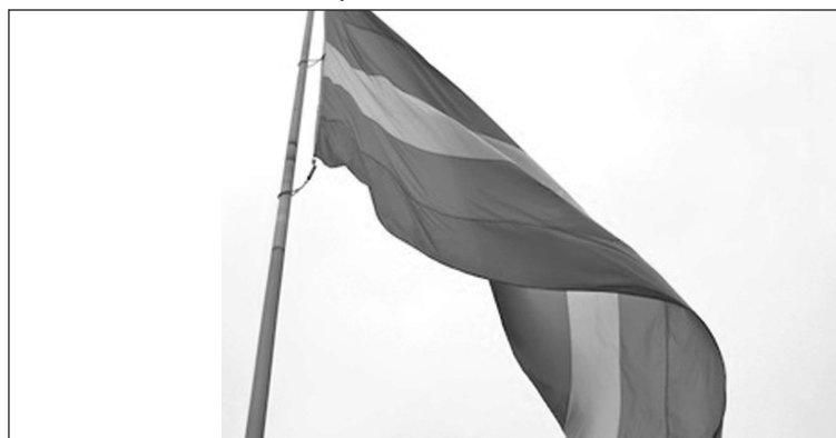
The Transgender Flag.

"West Hollywood has always been on the cutting edge on civil rights, and we hope to