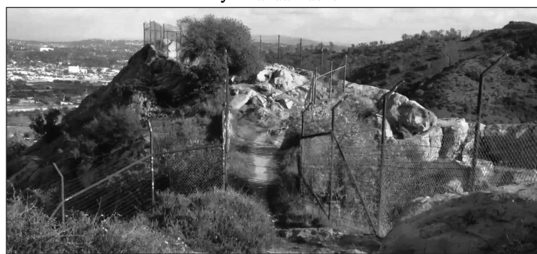
Top of Bee Rock in Griffith Park. waded down a park ranger around 1 p.m. when they spotted the body at the bottom of a 300-foot rocky cliff. The area, com-

monly referred as the "Captain's Roost," is used by bicyclists, hikers and active people for outdoor exercise. The coroner's office