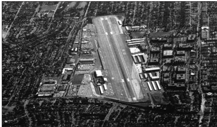
Aerial view of Santa Monica Airport.

The public has expressed concerns regarding the airport's safety and operations since the aviation industry boom in the 1960s. The lawsuit cites a 2010 report by City Council that concluded, "The status quo at the Airport is not acceptable to City residents." Community members complained about issues such as increased air traffic,