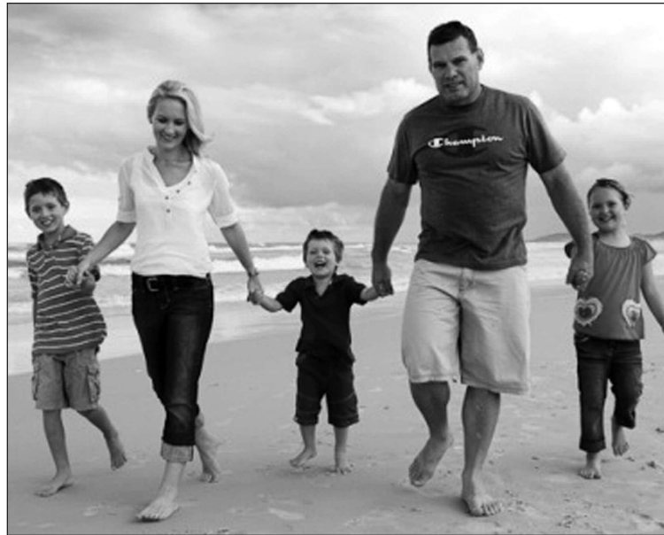
We grow and learn new things as we age.

This is not a tale focused on growth in the career field; it's in life in general. Being a better parent, a better brother, sister, friend, teacher, etc; the list goes on and on. It's all about decision-making. What possible outcome or fallout could happen from my actions? Many of us see a secret or mis-