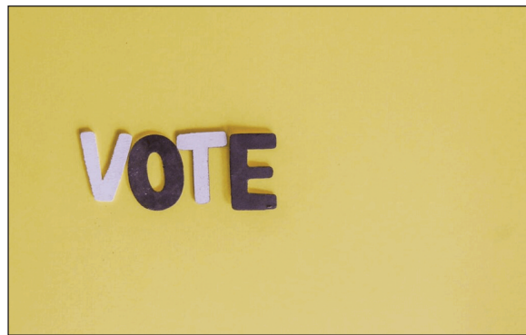
Voters went to the polls to vote for candidates for 2 seats on the Beverly Hills City Council.