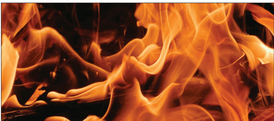
A fire erupted at a Pacific Palisades home on Sunday, March 3.

A total of 31 firefighters took 34 minutes to access, confine and fully extinguish a fire involving a vehicle and contents within the garage of a 5,288 square foot property. There were no reports of any injury. The cause of the fire is currently under investigation by officials.