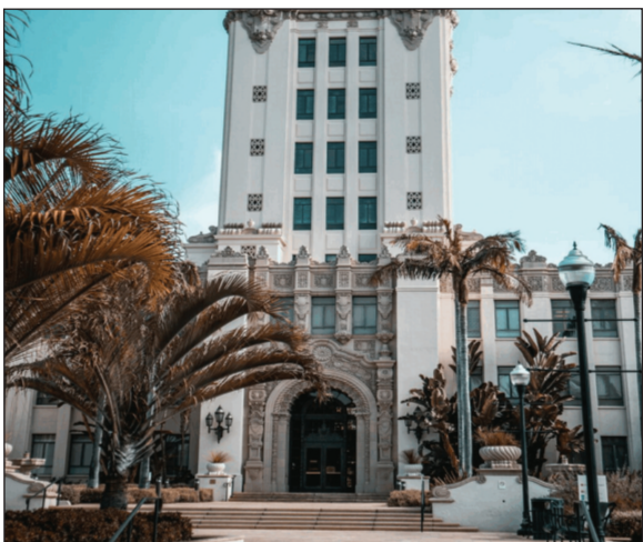
Beverly Hills City Hall.