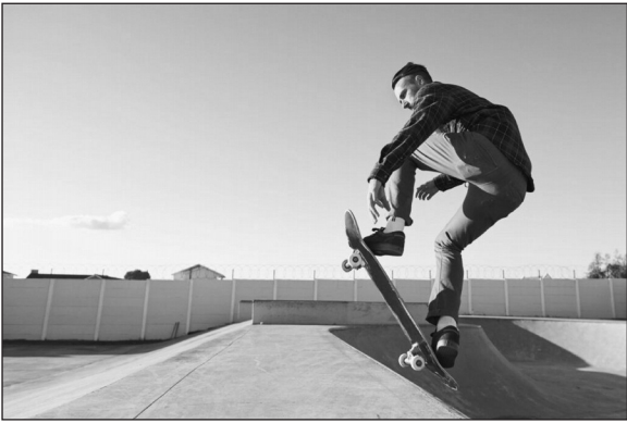
Movement is being made on a permanent skate park in Malibu.

-Allowing the neighboring property owner to install landscaping at its own cost to improve the park and prevent graffiti along the perimeter wall of the Skate Park.