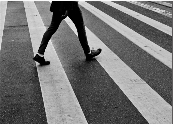
The SMPD will be conducting two Bicycle and Pedestrian Safety Enforcement Operations on March 7 and March 8.

The extra enforcement efforts will take place on Thursday and Friday between the hours of 6 a.m. and 9 p.m.