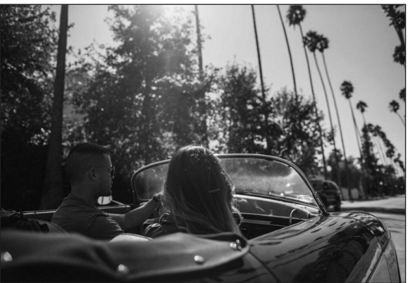
WEHO Road Closures.

Sunset Boulevard, N. Vicente Boulevard, Santa Monica Boulevard, and Doheny Drive