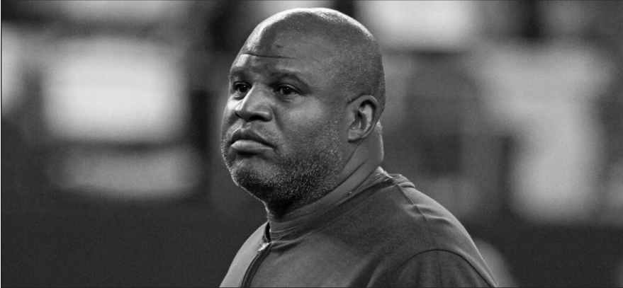
Eric Bieniemy is becoming the UCLA Offensive Coordinator.

“It is an opportunity for my family and I to return back to a place we once called home. This is a great opportunity for me to utilize all of my experience working with future Hall of Fame players and a Hall of Fame head coach [Andy Reid] to help teach and inspire young men on what it takes to be successful on and off the field.”