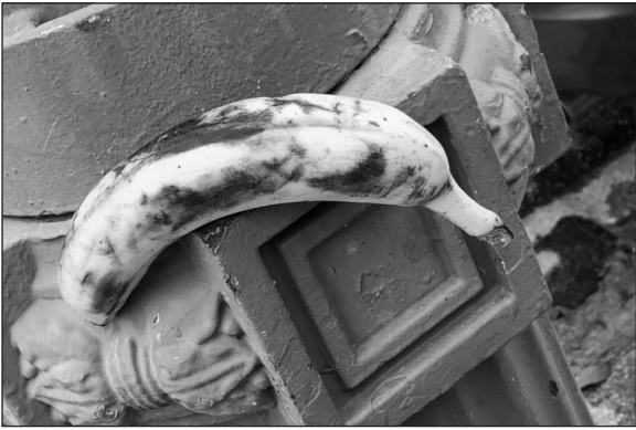
Banana on Vine...