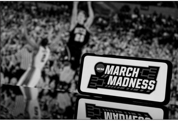
Are you ready for March Madness?

UNITED STATES—Oh, I love this time of year. I’m referring to March Madness which is about to kick off in less than a week when it comes to college basketball. It pits the best of the best with the underdogs in the basketball arena and its simple people: win or go home. Things will kick off on Sunday, March 17 of all days, for those not in the know that is also St. Patrick’s Day so you will be seeing plenty of people celebrate their teams making the Big Dance and those who do not.