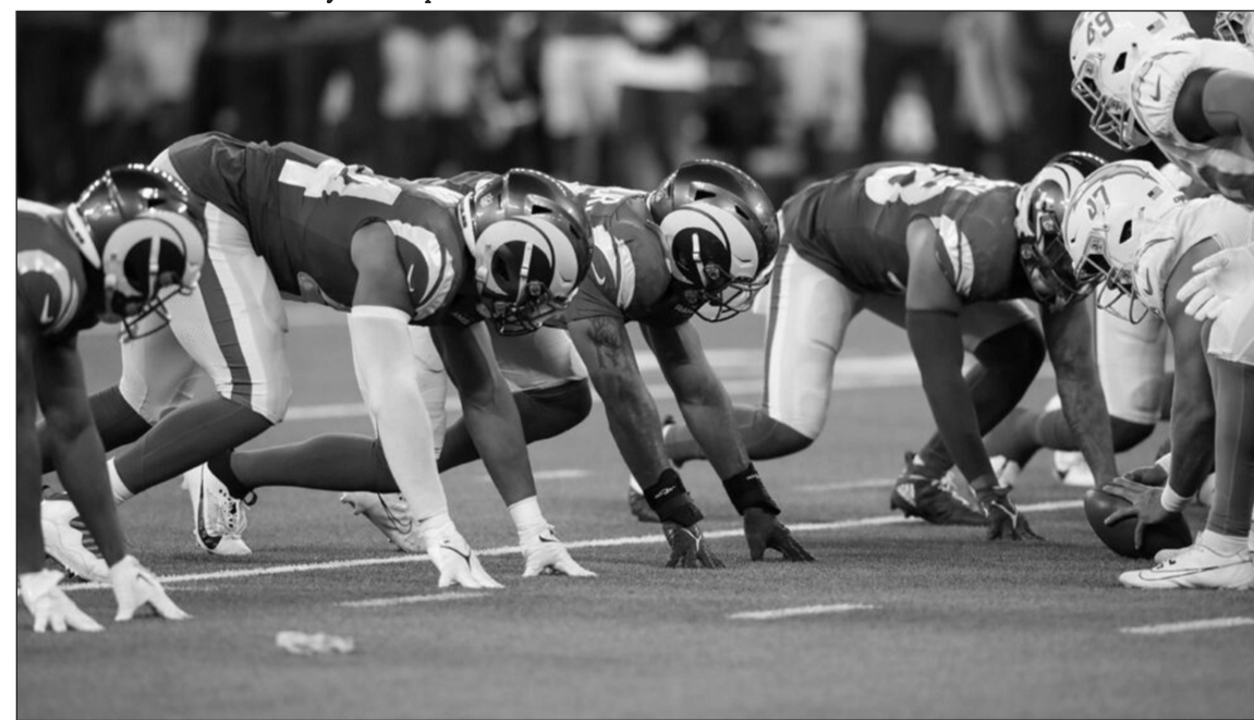
The Rams have added Myles Garrett to the team.