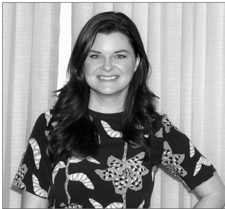
Heather Tom portrays Katie Logan on "The Bold and the Beautiful."

Making things more intense is the big reveal Deke has signed on to be a designer at Logan. He was a bit apprehensive, but Hope, Katie and Bill convinced him to join. The team is building, but I still think a fresh face to the Logan fashion house would do wonders because they could shake things up in a way not