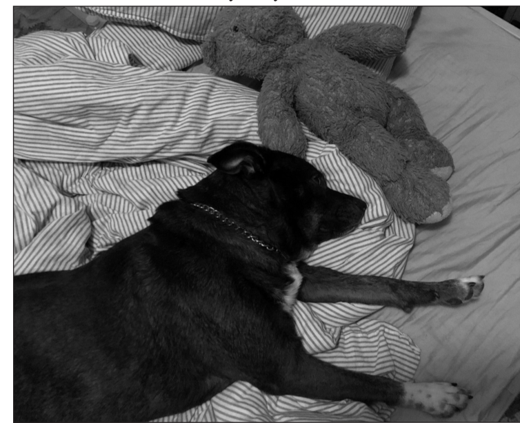
Luna is convalescing nicely.

The secret-sauce of sugar-free gum is Xylitol, an artificial sweetener good for human teeth, and potentially deadly to canines. Look, I did it once and lived to yet