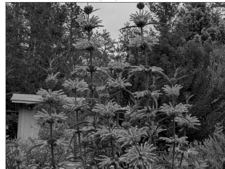
Lion's tail has oddly aromatic foliage.

Aromatic foliage is not all herbal. Also, several plants that are not herbs have exceptionally aromatic foliage. Both trailing and shrubby lan-